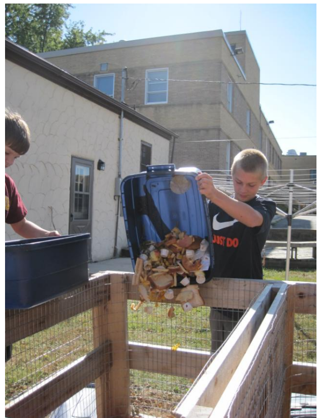
"St. Mary's students learn about composting"

Lifetouch will return on Thursday, October 27 . Photographs will be taken of those who were absent on picture day in September or need retakes. Picture envelopes are available in the office. If you would like student pictures retaken, please follow the instructions in your picture packet.